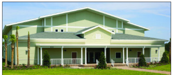
Windermere Prep Gymnasium

Designed for sale or lease to either a single user or multiple users, Southport Center is a speculative industrial building containing 73,000 square feet of space. The property offers 24' clear height and a dock high floor slab to potential businesses. The building was constructed using tilt-up concrete wall panels with a painted exterior surface.