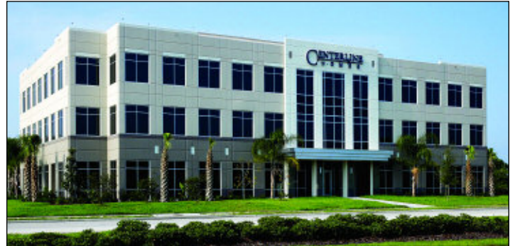
Vistawilla Office Building

This 65,000 square foot interior renovation project involved the creation of new office area in first generation space located in a Lake Mary, Class "A" office building. The work resulted in new wall partitions, interior doors and glazing, floor and wall coverings, acoustical ceilings, security systems, mechanical/electrical/fire protection renovations and installation of a new emergency generator.