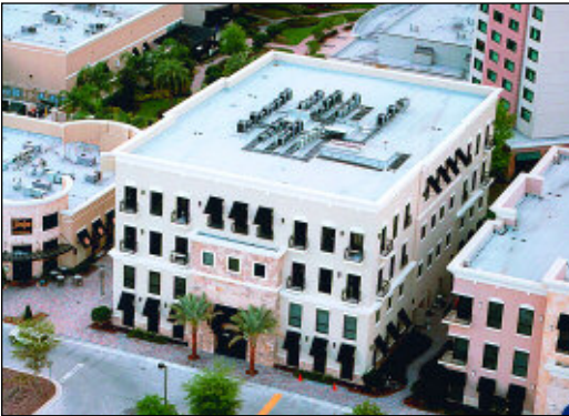
Park Place at Heathrow, Bldg. E

Building E is the second office condominium project completed by Pertree Constructors at Park Place at Heathrow—a mixed use development in Lake Mary, Florida. Pertree