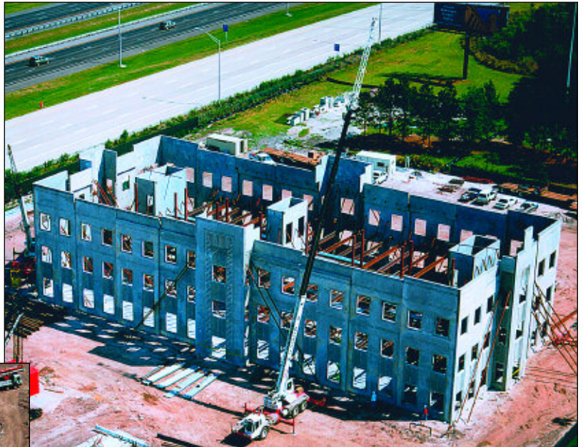
After curing, the tilt-up wall panels are lifted into place and connected to the building's structural framing system.

During this process, wooden forms are constructed on top of the building floor slab after it is completed. These forms then create a mold for each wall panel