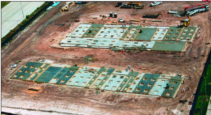
Tilt-up wall panels are formed and poured on the building slab or a special casting bed.

and include openings where doors or windows are located. Special liner forms may also be used to create an architectural look (fluted block, brick, etc.) or accent features (such as reveals) on the exterior surface of the wall panels. Concrete is then poured into the forms. Once the concrete has reached a desired strength, the forms are removed and the finished wall panels are lifted into their proper vertical position by a large crane. Initially the erected wall panels are held in place