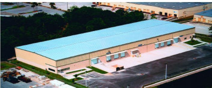
Mercy Star Court Warehouse

This project involved completion of a 29,000 square foot speculative warehouse property designed for occupancy by a single, or multiple tenants. Building construction utilized full height metal wall panels; a pre-engineered structural framing system; and an MR-24 standing seam metal roof. All of the pre-engineered building components were supplied by Butler Manufacturing Company.